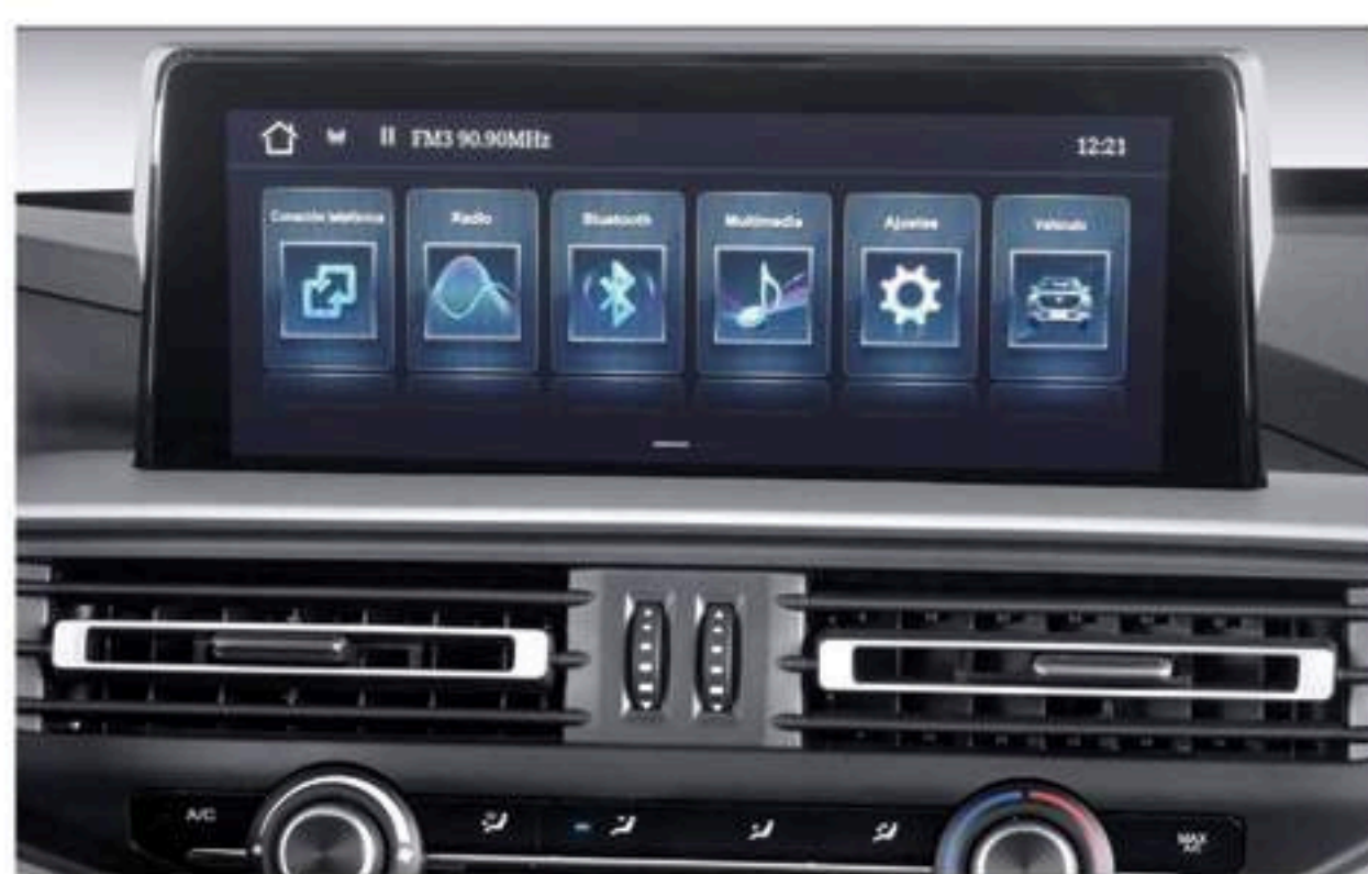
10" Multi-Media Touch Screen with Rear View and Right Blind Spot Camera