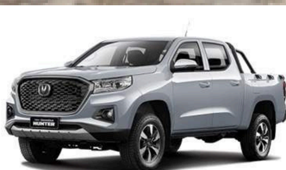
Diamond Grey Silver