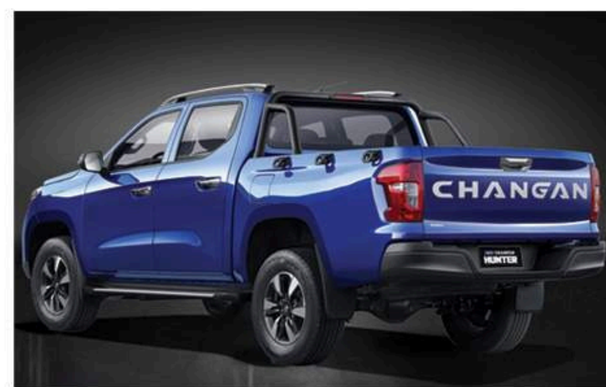
Best in Class 1000kg Payload Capacity and 3500kg Towing Capacity