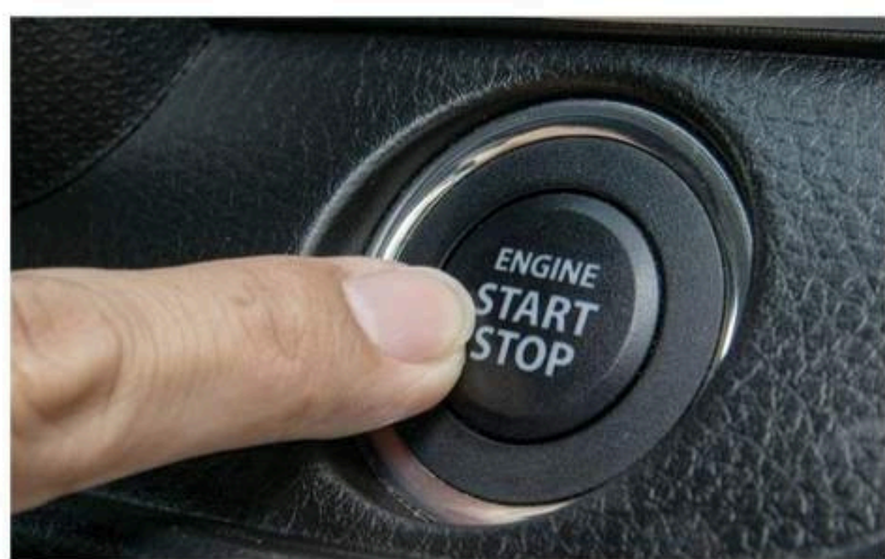
Smart Keyless Access with Push Button Engine Start