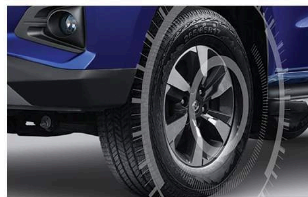
18 Inch Aluminum Wheels